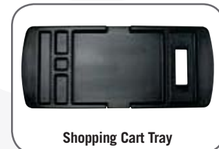
Shopping Cart Tray